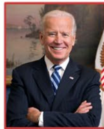
Joe Biden President of the United States