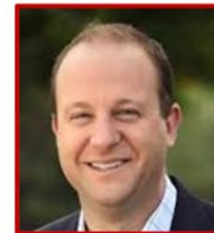
Jared Polis Governor of Colorado