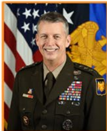
Gen. Daniel R. Hokanson Chief, National Guard Bureau