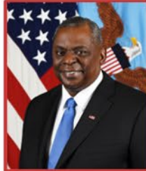
Lloyd J. Austin III U.S. Secretary of Defense