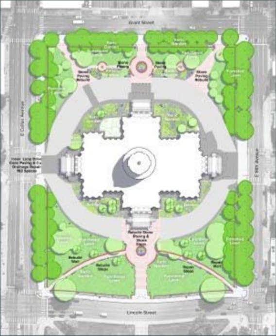
Concept B – Rebuild