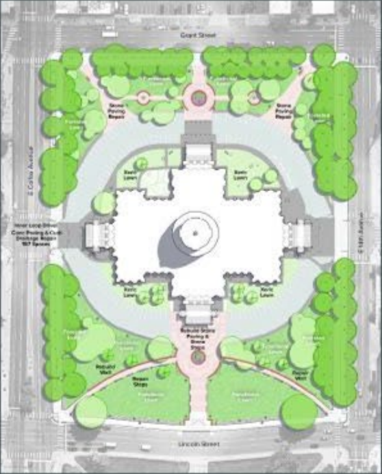
Concept A – Critical