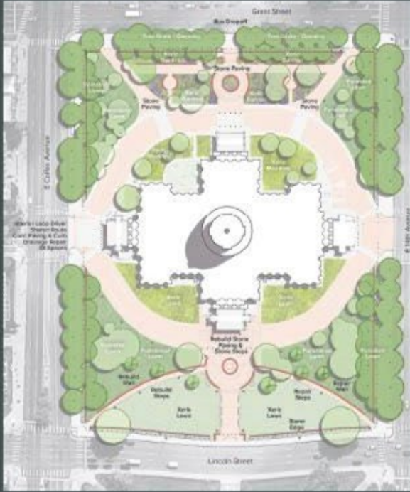
Concept C – Reimagine